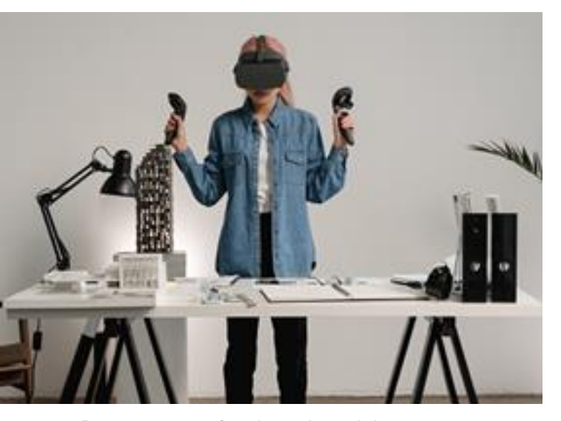
By now most of us have heard the crazy headlines - virtual real estate sales in the metaverse topped $500 million last year, with someone spending $630,000 just to buy a digital

In essence, it isn't too different from when you shop on the internet. The metaverse simply aims to make the experience more immersive, bringing you closer to the 'real-life' experience.